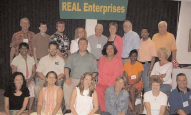
2005 Georgia REAL Institute Participants & Staff

Once again, Hilton Head Island proved to be an ideal location for all involved in the Institute. Participants found time to engage in many of the Island's activities such as bike riding, parasailing, and taking an evening cruise to see the dolphins. Georgia REAL is planning to return to Hilton Head Island for the 2006 Institute. You may visit our website for updates and register online soon.