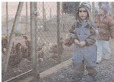
A kindergarten student next to his Teina Chicken business as shown in a Norwegian newspaper