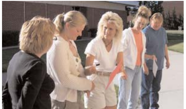
K-8 REAL Participants work through the "Red Tape" activity

Would you like to have a K-8 REAL in your area? Institutes can be tailored for 2-day Workshops on each of the